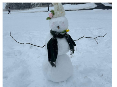
The winning snowman (top left) beat out the five other entries.