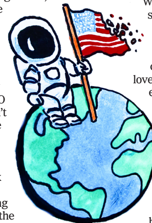
GRAPHICS BY ALICIA FENG '28

While many will see this shift in Carney's view of the world order as a bad sign, I'm hesitant to view it with such cynicism. Of course, I love America, and some egotistical, patriotic part of me absolutely wishes America could maintain its number one spot eternally—but no one superpower can maintain its top spot 100% of the time. What matters, however, is preventing nondemocratic countries like China from taking our spot. So, while a temporary absence of American dominance isn't necessarily a sign of impending doom, the values of whatever country steps up in the interim are crucial.