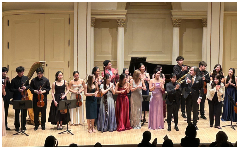
Students performed in the Young Artists Concert at Weill Recital Hall.